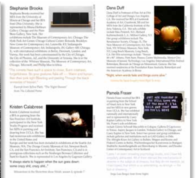
Because the Night Essay Internal Spread