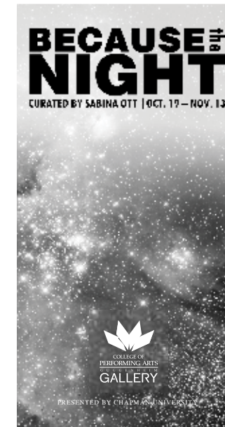
Because the Night Essay Cover 5.75" by 11"